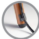
INCLUDED CABLE MANAGEMENT