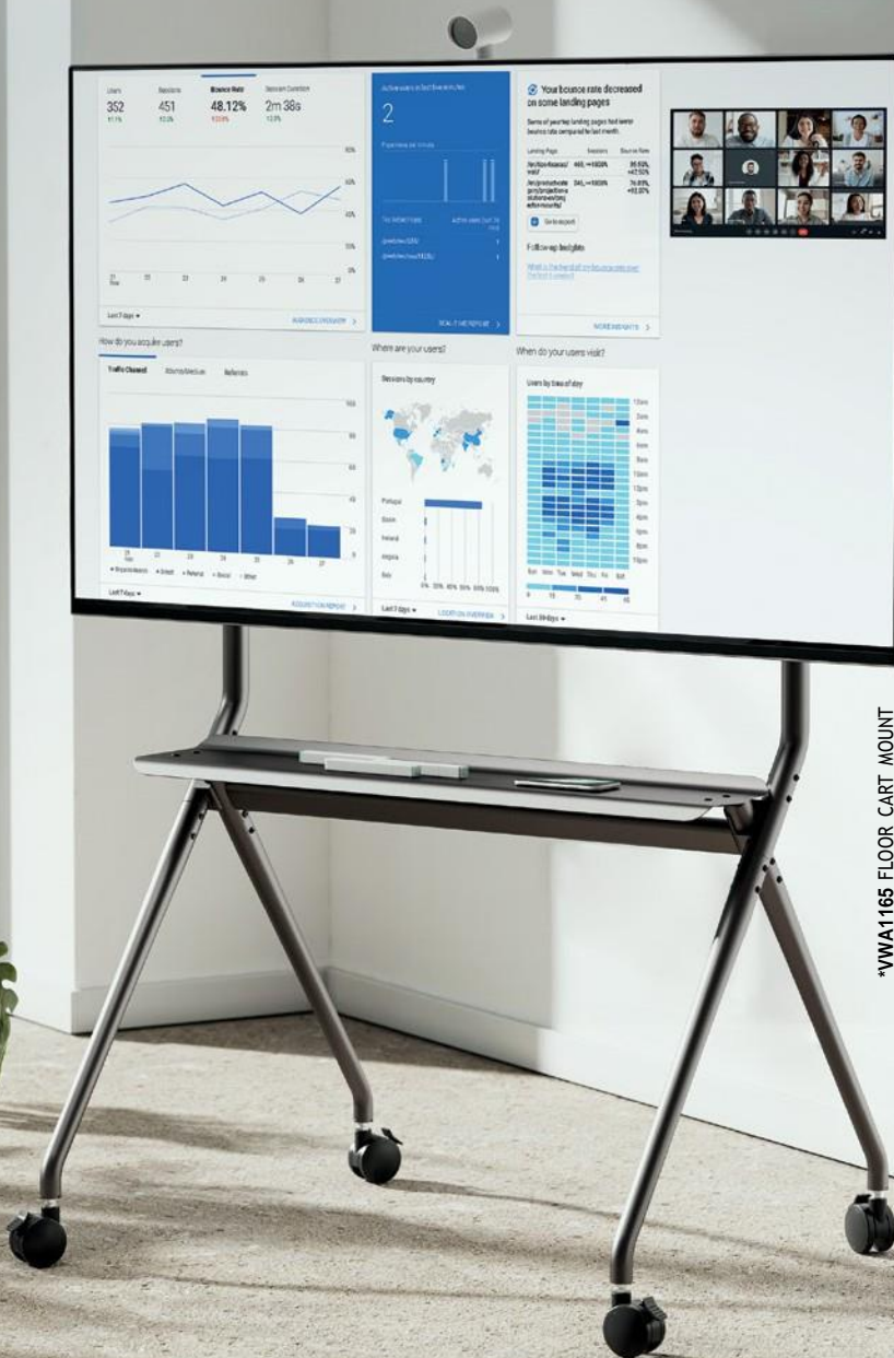
*VWA1165 FLOOR CART MOUNT